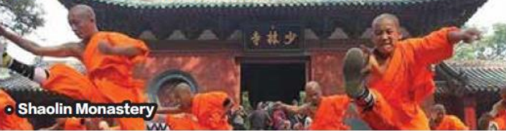
• Shaolin Monastery

After breakfast, proceed to Longmen Grottoes (include buggy) , being regarded as one of the three most famous grottoes in China, is a must see when you go to Luoyang for the first time. Next to the Guanlin is one of the three temples in memorial of Guan Yu, an important figure in the period of Three Kingdoms. Hotel: Grand Palace Hotel or similar (Local 4 stars hotel)