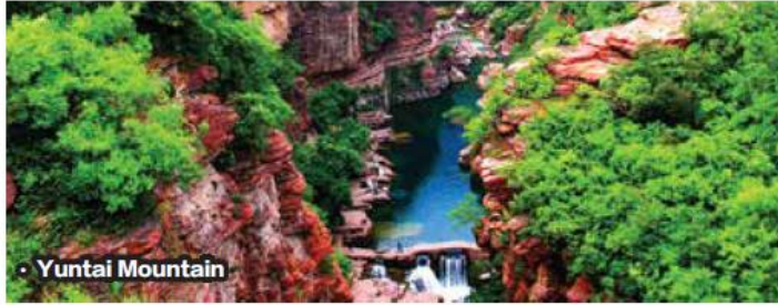
• Yuntai Mountain