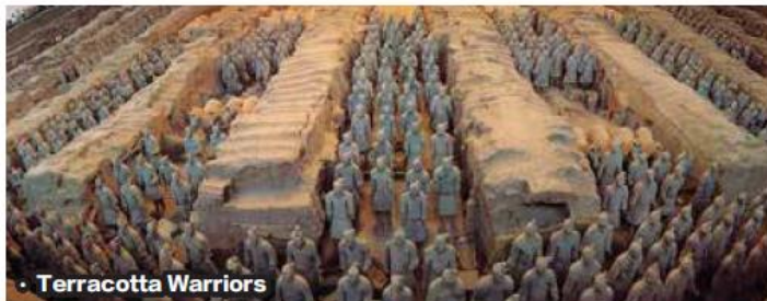
• Terracotta Warriors

Arrive home with all the sweet memories.